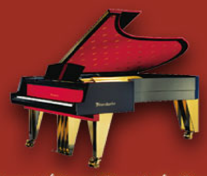
Imperial Grand Bösendorfer Piano

Be stirred, not shaken in the Bösendorfer Lounge, voted the "Best Place to Sip Martinis" by the Orlando Business Journal and voted "Best Hotel Bar" by Orlando Magazine. Designed to be edgy and intriguing, the Bösendorfer Lounge, the namesake of the Imperial Grand Bösendorfer piano (one of only two in the world) features a round bar decorated in black marble, red stones and mirror pieces and mounted with table